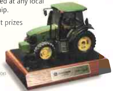
Signed by the 2017 John Deere Classic champion